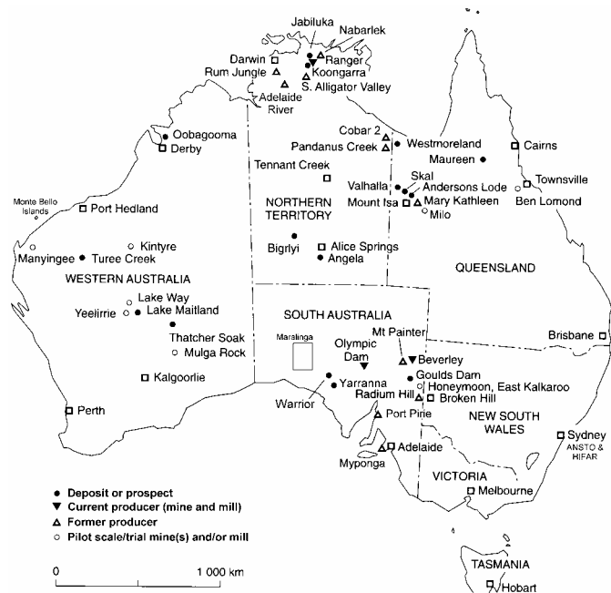
Figure 1 Australian uranium deposits and projects

The commercial production of uranium in Australia began in 1954, and is currently about 9,000 t U 3 O 8 per year. Small but determined attempts to develop a radium mining industry between 1906 to 1934 failed to lead to commercial uranium production (Mudd, 2004b). To date there has been a total of 11 uranium mills, including pilot projects, and 31 mines of various scale supplying ore to adjacent or nearby mills or for pilot milling and exploration work. The location of Australian uranium project sites and deposits is shown in Figure 1, with a compilation of production data in Table 1 and deposit size in Table 2.