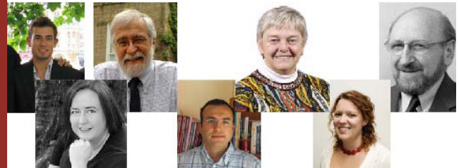
Collaborators from Cambridge U.K., Ahi Evran Turkey, and Michigan USA

The cross-cultural comparisons provide wonderful “natural experiments”, to contrast the impact of salient cultural features. As two topical examples, teachers in Germany are better paid; and, there is an over-supply of applicants to teacher education programs in Turkey. We will be able to explore how salary impacts decisions about teaching in Germany vs. the U.S. and Australia, and why teaching seems to be a more attractive career in Turkey.